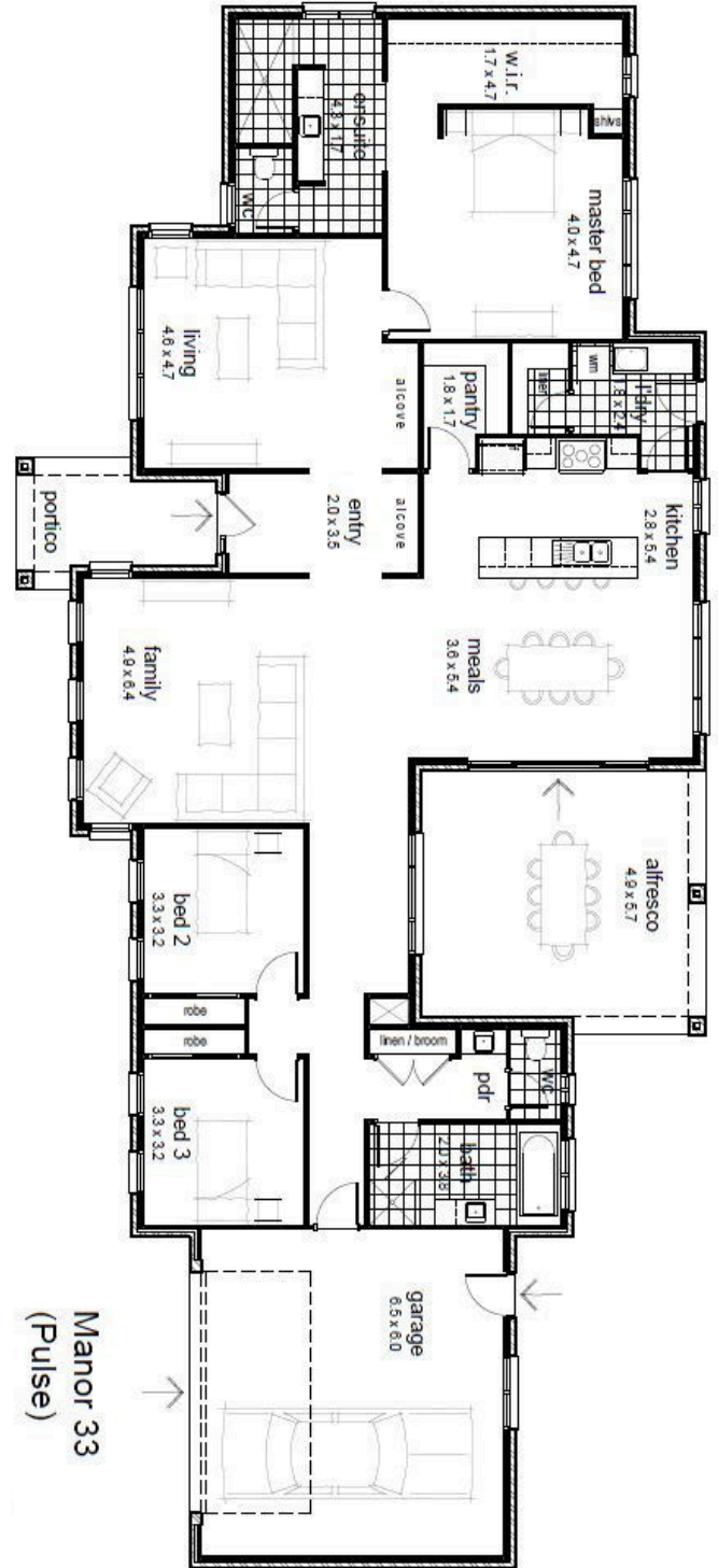
Manor 33 (Pulse)